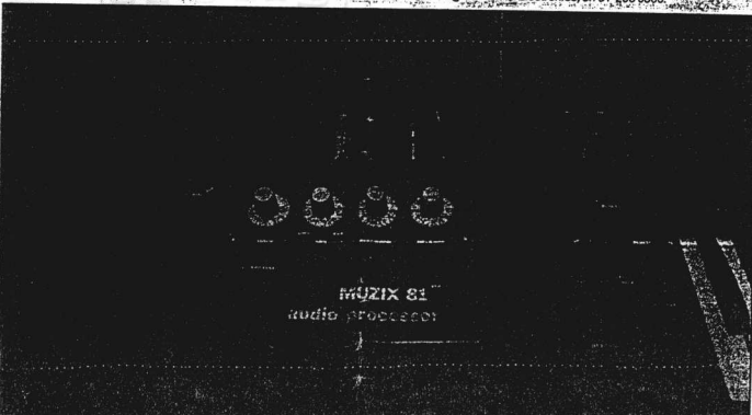
The audio processor with ZX81 and SH101 squeezing into the picture.

U.K. agents for the system are Vulcan Electronics , on 01-203 6366.